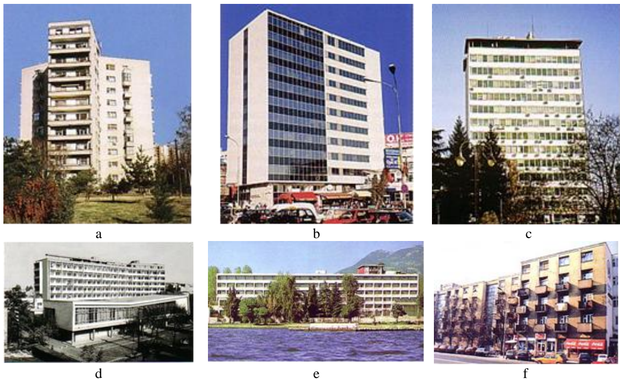
Figure 2. The international character in Macedonian architecture 1945 -1963