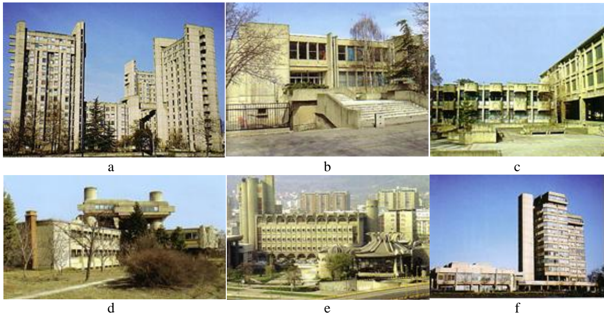
Figure 3: Brutalism in Macedonian architecture 1963-1980