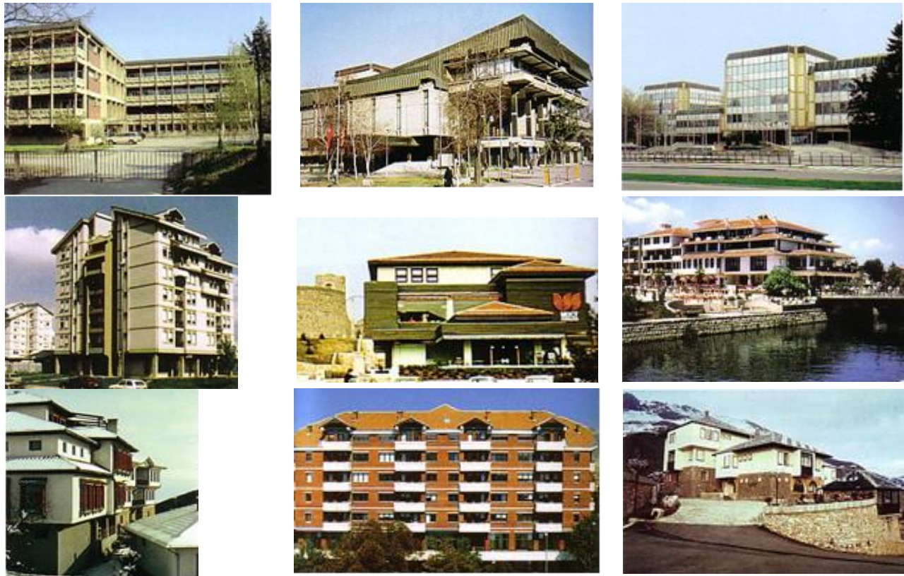
Figure 4. Modern Architecture in Macedonia, late 1980-1990

actors will find their place in the architecture that was able (allowed) to mark the Zeitgeist of the time, and also to keep the 'secrets' of the source from where architects were inspired.