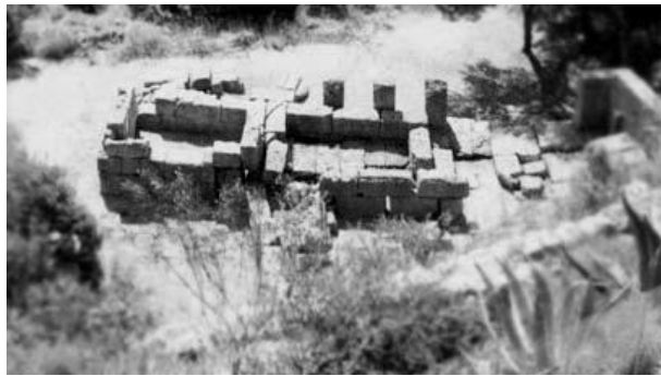
Figure 6: Akragas, St. Biagio's fountain. Inside the northern tanks; detail of the socket of the pottery pipe (ph. by A. Fino).

Later, because of a aquifer decrease, it was decided to offset the pressure levels, lowering the amount of channel outlet, from the central cave to the northern tunnel, the latter built on this occasion. The presence of a new paving, made by tiles laid together with hydraulic mortar, on the bottom of the southern tank, no longer visible, suggests that the two tanks were damaged in different ways. At the time, it would be running only the Southern basin, fed from the northern aqueduct by a canalization, which lacked the pottery pipe (Figure 6).