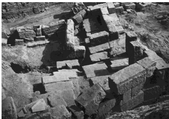
Figure 8: Agrigento, S. Biagio, 1932. The entire monumental complex