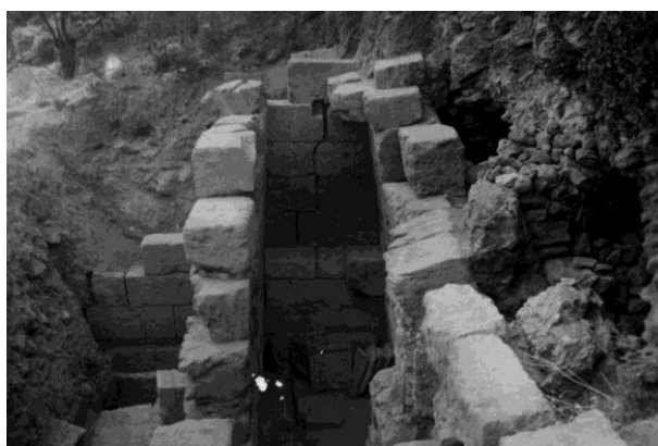
Figure 9: Agrigento, S.Biagio. The connexion between Rupe Atenea and archaic fountain (Marconi 1929, p. 2).

In the same context, Cultrera noticed that, in the West, where the fountain leans against the cliff, calcarenites appeared compact inside and crumbled outside, composed of terrain and mixed size stones. This material, already known by Marconi, seems not to be random arranged, but organized in overlapping blocks, a technique similar to the dry construction's one (Figure 9).