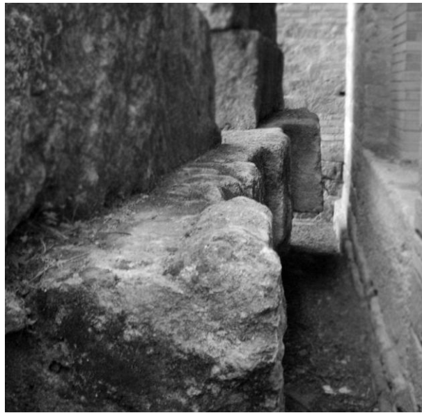
Figure 2: Akragas, St. Biagio's fountain. Detail of the seat for the water supply system

bifurcation of the central pipe, resting on the fifth row of the ashlar masonry; in fact, the seat for a root-canal-treatment north southern oriented is visible on the blocks' top surfaces. (Figure 2)