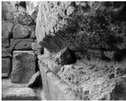
Figure 5: Akragas, St. Biagio's fountain. View from the top of the cliff of the two late tanks.

Starting from the central cave the source of supply went on in the highest row of the dividing wall, up to reach the new containers. As Marconi noted, the top of this partition was put in connection with the central cave by that "rough bridge" which was clearly removed (Marconi 1929, p. 8).