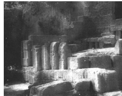
Figures 11, 12: The archaic fountain, 1932-1941. Small interventions of consolidation and anastylosis.

Thirty years later, from 1975 to 1981, new events affect the monumental structure; in this period there are not any important restorations, except for the reopening of the window near the southern cave, in the likely attempt to make stable the structure by lightening the loads.