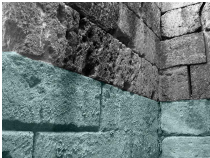
Figure 3: Akragas, St. Biagio's fountain. Detail of the ashler masonry inside the tanks. In blue the water level.

However, the two tanks' intake holes are not visible on the bottom; it is likely that those holes were set where other openings have been realized later, after the completion of the wall. The function of the tanks as reservoirs is showed by the presence of two depressions on the floor for decanting, cleaning and maintenance, according to a well attested use (Tölle-Kastenbein 1993, pp. 24-32). From the tanks that are waterproofed up to the fifth row (Figure 3)