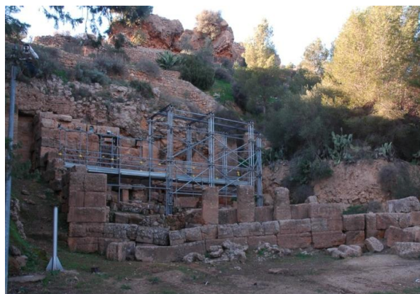
Figures 16, 17: Agrigento. The archaic fountain before and after de-restoration, 2012 (Ph. by V. Santoro).