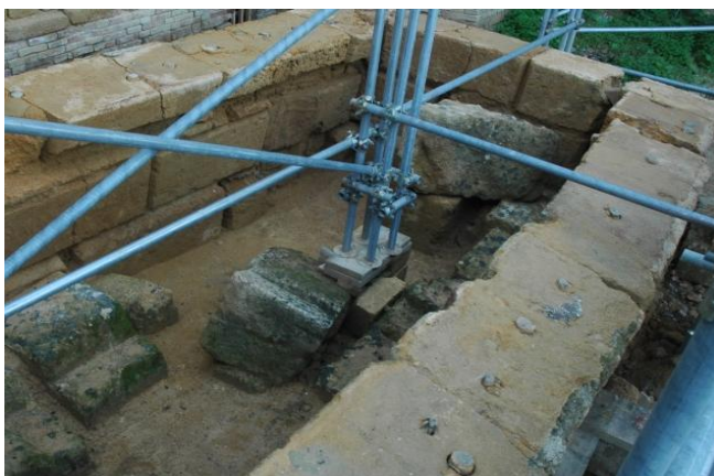
Figure 15: The archaic fountain, 2012. De-restoration the north-eastern corner.

Because of the strong link between architecture and background, the natural dynamics of the site interact on the architectural complex since its inception, insomuch that they affect the several functional changes during the use and they determine, since its discovery, a worsening in the structures preservation. In fact, since 1931, frequent restorations affect the monument and the site, and some of them in the second half of last century were quite invasive. In the Eighties, for instance, a fastening system, which used iron bars and epoxy resin, was inserted in the masonry for static consolidation of the load-bearing system.