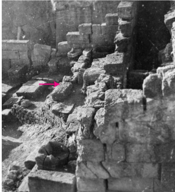
Figure 4: Akragas, St. Biagio's fountain. View from the North; the arrow shows the supposed stylobate.

The water flowed through the drip nose, through which the tanks below could fill up, or under which we can imagine a block shaped to support the hydria. About the location of the drip nose, it should be noted that the two side openings of the main façade have no threshold, which could have hold the blocks whit the nose whether placed above the water's level. In order to protect the fountain originally there could be a basic wooden porch of which we can see a possible stylobate in the excavation's photos (Figure 4)