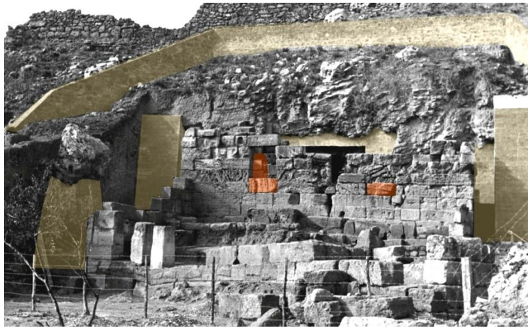
Figure 10: The archaic fountain, after the G. Cultrera Restorations (1932).

still recognizable (trapezoidal retaining wall, pillars for the cliff and supports inside the building) in order to make safe the site and the monument (Figure 10) (Cultrera 1942, pp.615-618).