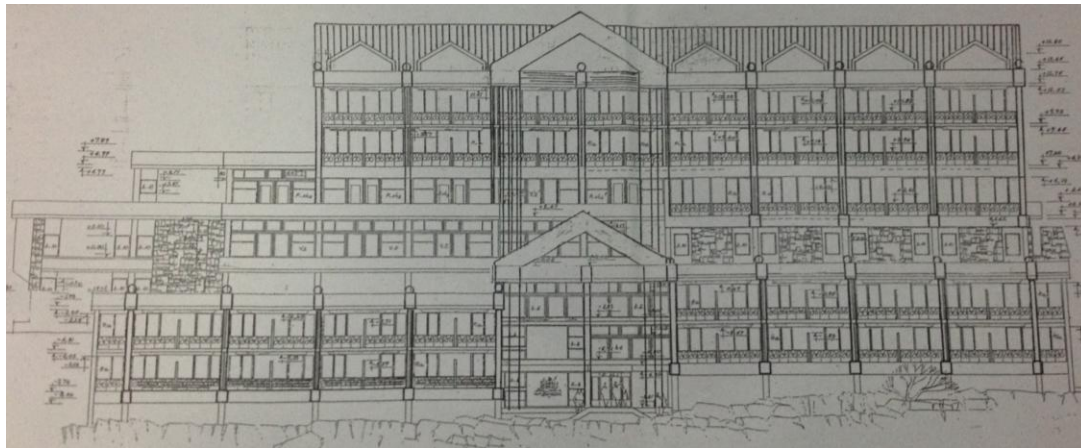
Figure 3: South Facade after adaptation (Instituri i Projekttimeve Tirane)