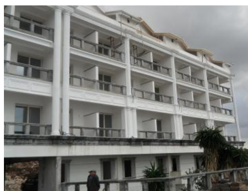
Figure 4: Photos of the Hotel after adaptation