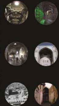
The bazaar as interiority