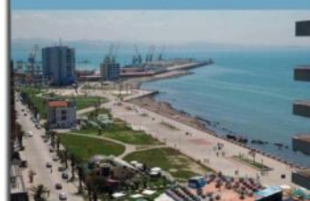
FIG. 7: DURRES WATERSIDE

Durres, which is located in the cost of west center part of Albania, near the capital city Tirana. Durres has a population of 203.550 inhabitants and an area of 46.1 km 2 . The total number of businesses is 5,622. The city consists of two parts: the central area, the informal area, the harbor and the urbanized coastline, which is occupied mainly by tourist's flats. Durre is one of the most important points of tourism development and has the largest Albanian port .