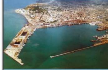
FIG. 4: THE PORT OF DURRES