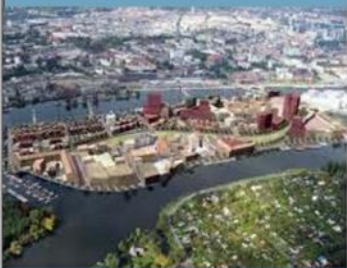
FIG. 3: HAMBURG WATERSIDE

The city of Hamburg is located in north Germany. It is the second largest city in Germany with an area of 755 km 2 . The city's population is more than 1.8 million inhabitants and 4.3 million in the metropolitan region with a density of 2,362.9 /km 2 . The city has the highest GDP in Germany and a relatively high employment rate (88% of the working age).