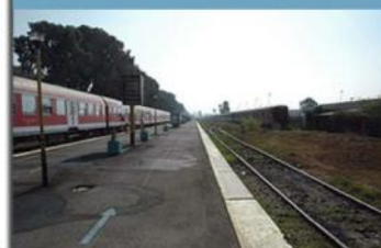
FIG. 5.6: DURRES TRANSPORT SYSTEM