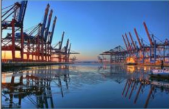
FIG. 1: THE PORT OF HAMBURG