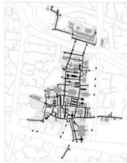
Open spaces of Tabriz Bazaar, Golkar.