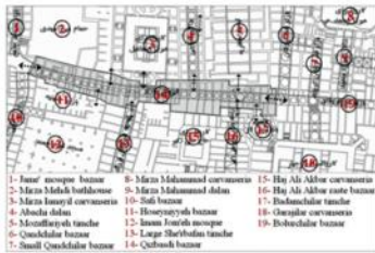
Bazaar of Tabriz: a large number of socio-cultural spaces are organized within the linear structure of bazaar

One of the most important spaces in the cities are traditional commercial spaces namely bazaars. Bazaar as what known today is a particular of this territory and evolves in thousands of years. Islamic cities had a specific structure which the man urban land uses was found in bazaar Palace and social life was flowed in Bazaar. These evolutions were highlighted from earliest age of Islam's born. But since Ghajar new terms used instead of elder manner. In this article the bazaar evolution of physical and functional structure and causes and then other elements which compete with bazaar will be researched.