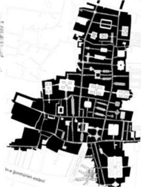
Compact fabric of Tabriz Bazaar, Author