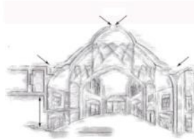
Tabriz Bazaar, Mohammad Qoli Timche