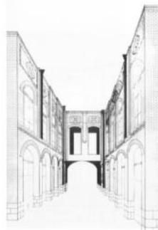
Bazaar Raste Near the main Tabriz Raste Raste