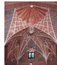
Mozafariye Timche in Tabriz Bazaar