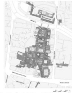
Location Introduction of Tabriz Bazaar, Golkar.