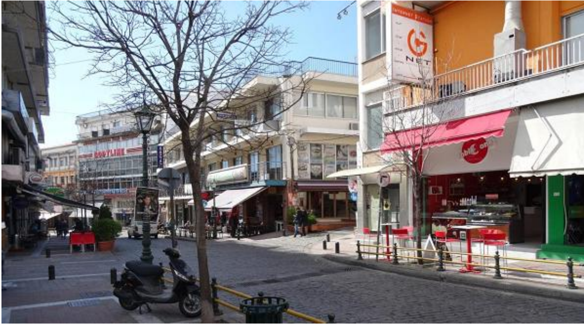
Figure 1 Vehicles have been given the amount of space required for their comfortable passage. This is a proper layout to accommodate pedestrians.

The walkways are not decoration elements. They are the pedestrian crossings; thus, they ought to be smooth, without obstacles and brightly painted. In Xanthi's urban area, it is not an infrequent phenomenon the crossings with faded stripping lines (Figure 2)