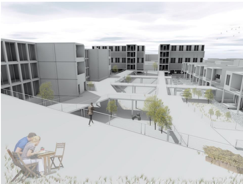
Figure 5. The solution