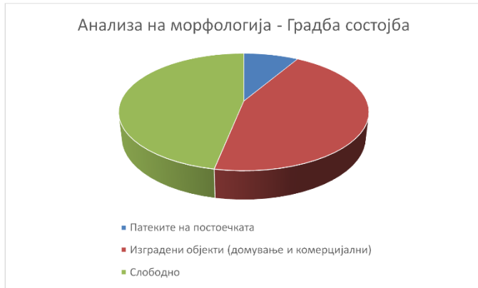
Figure 4. Morphology analysis

which the atmosphere will be the main goal, and people from the daily routine to relax in their homes, from hard to home.