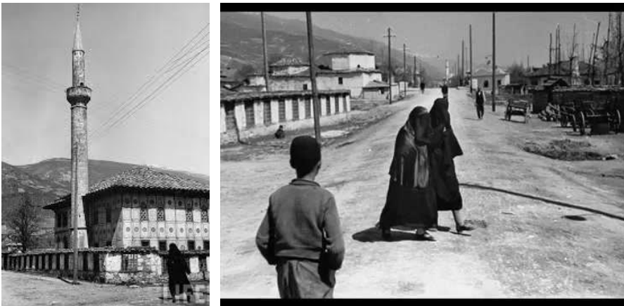
Figure 1. City of Tetovo

Our research focuses on the unique concept of integrative housing in the city of Tetovo and the functioning of the urban structure of the historical-cultural character. With this research, we will expose the historical and cultural character of one of the oldest sites in the city of Tetovo.