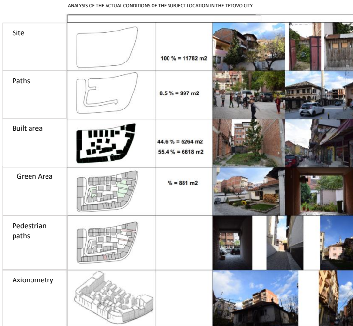
Figure 3. Analysis

In the language of urban architecture, an important means of improving the image of the city is the attitude towards cultural objects.