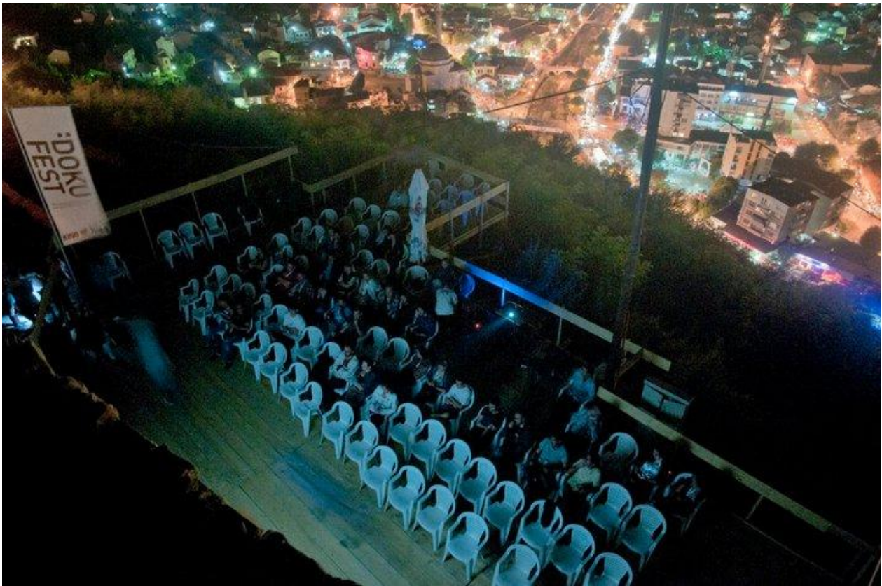
Fig. 8: Improved Cinema in Fortress of Prizren.