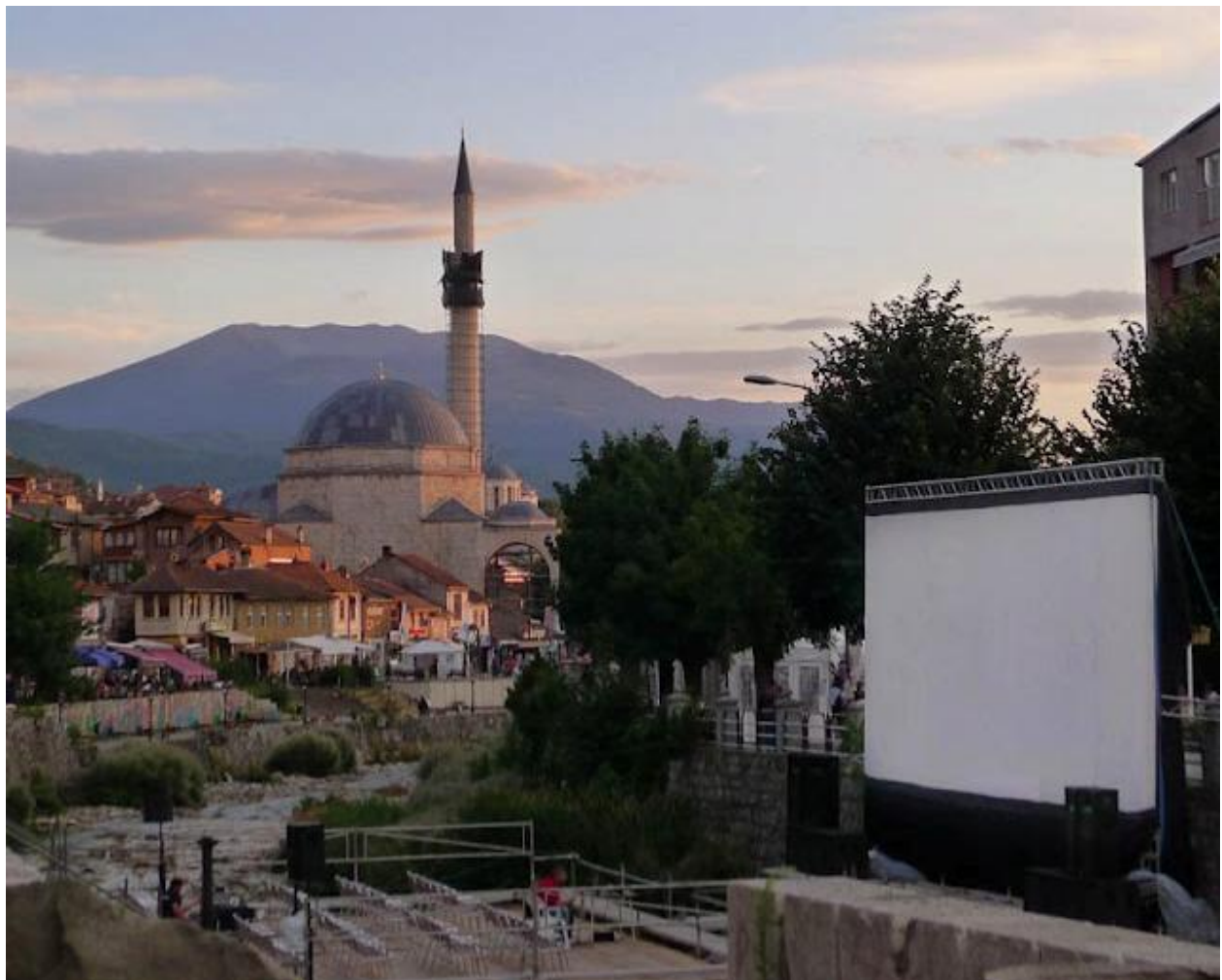
Fig. 9: Improved Cinema on the River Bistrica in Prizren.