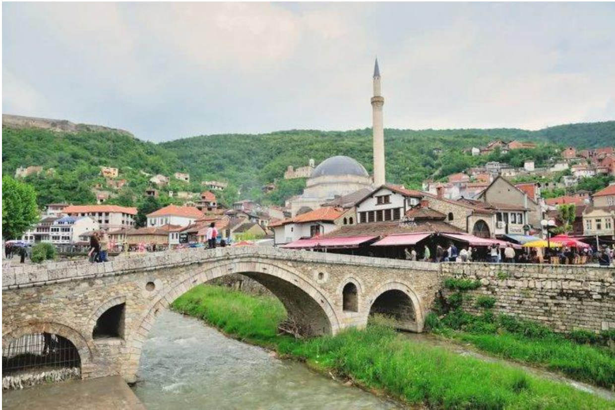
Fig. 1: A view towards the Stone Bridge, River Bistrica, Sinan Pasha Mosque and Kalaja of Prizren.

cut the whole town up, giving the town an oriental physiognomy. The craftsmen of Prizren are well known for their beautiful gold and silver articles, embroidery, the Prizren cloth, knives, and other folk handcrafts, trades which Prizrenians have preserved throughout the centuries. 2