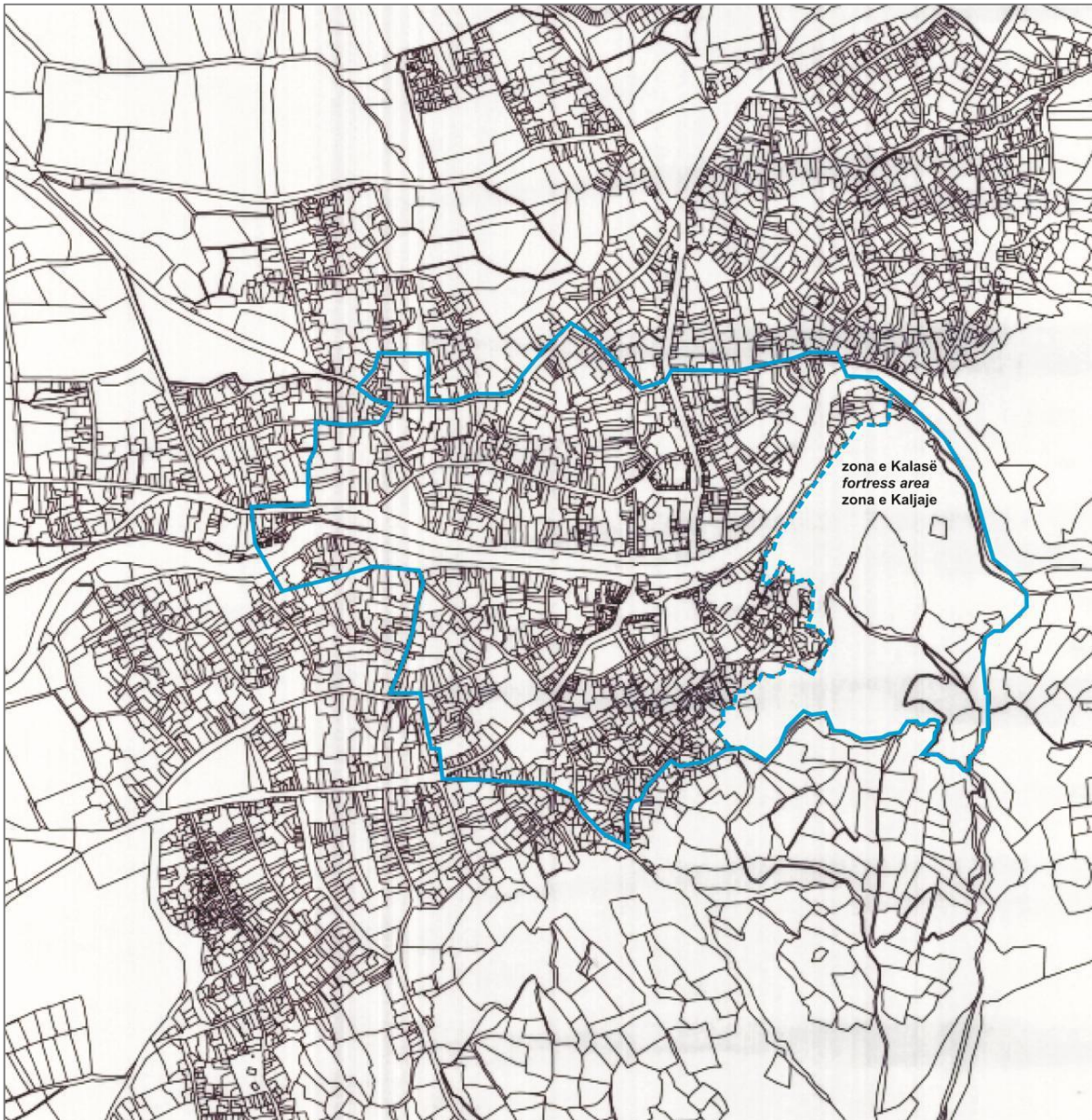
Fig. 4: The Historic Centre of Prizren.

Within the Conservation and Development Plan for the Historic Zone of Prizren made by CHWB in corporation with Istanbul Technical University in Turkey in year 2008, the Historic Zone is divided into eight sub zones, but the Fortress area and an additional part west of the historic centre is not included, as shown in fig. 5.