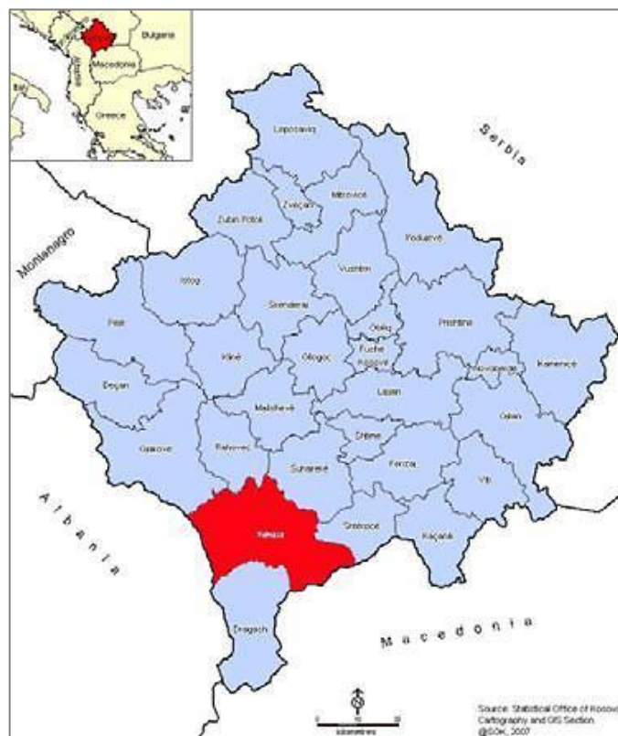
Fig. 2: Prizren in Kosovo Map.