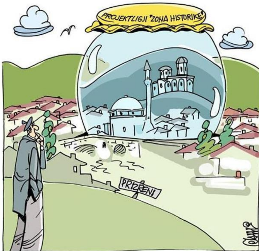
Fig. 7: The Illustration of the Law on the Historic Centre of Prizren.

This also violates the fundamental principles of the constitution of Kosovo: secularism, neutrality in matters of religious beliefs, discrimination and property rights. This law encourages more religious and ethnic hatred and conflict, taking into account that Prizren is known throughout history as a city of cultural, ethnic, religious and language diversity.