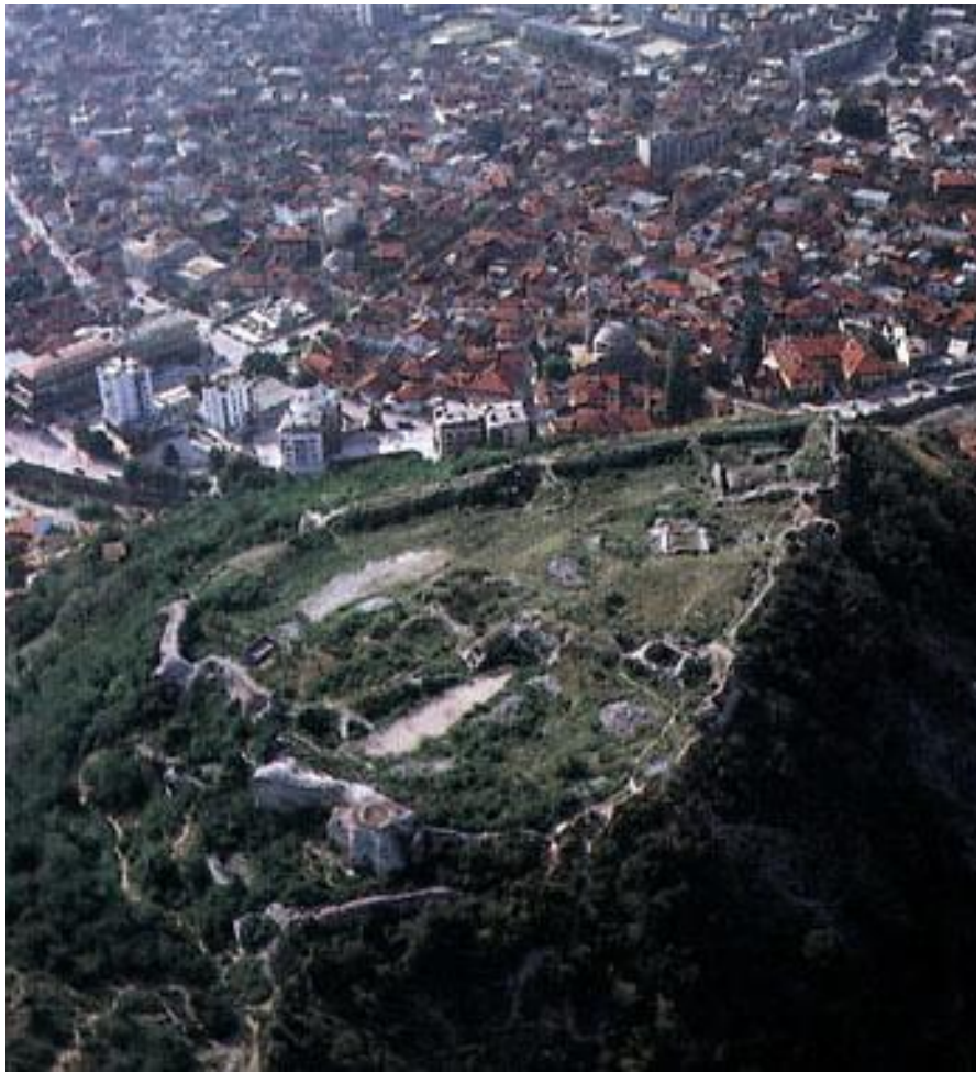
Fig. 6: Fortress (Kalaja) of Prizren