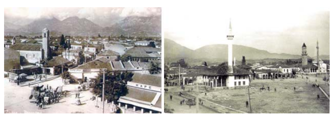
Fig. 3: Entry of the "Xhemal Pashe Zogy" street, today "Dibra Street, on the left ST. Evanghelizmu church on the right the old Bazaar. Demolish during the communism peiod. Karapici Mosque- demolished to built Tirana's city hall in 1939