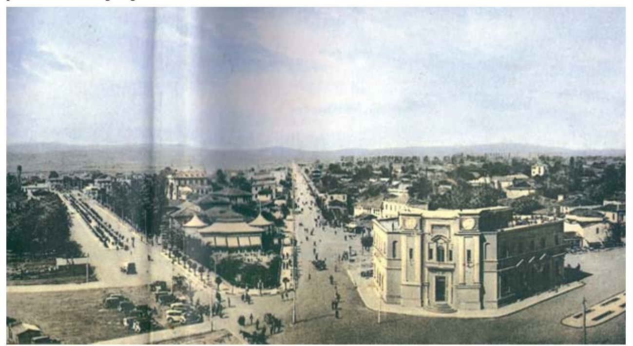
Fig. 6: Musolini boulevard (Today the Kavaja Street), Kursali Kafetria (Known as Tajvan Cafeteria), Mother Queen Boulevard (Today Durresi Street), and the old municipality

"It was a big and important building. With its heavy and monumental shape it impost you the fear and the respect for the government. It was fear to pass next to it, and if you had to enter there... there were problems... (Laughing)"- a habitant of Tirana.