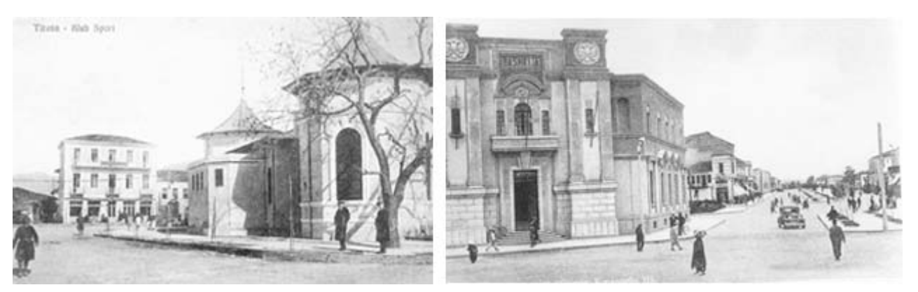
Fig. 5: Left- Kursali Cafeteria, known by the habitants as "Tajvan Cafeteria" and Sport club Tirana, right view- The old Municipality, knock down in 1981.

Next to this cafeteria the Italian architects used to build a two floor building with neoclassical elements which was demolished in 1981 to open one street and to build the national museum at that same place.