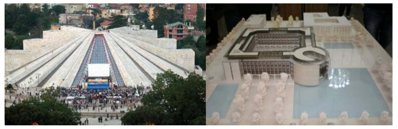
Fig. 8: Left, the existing building of Piramida, the National Culture center, as a public place- Right-the new model proposed by a Austrian architecture studio, parliament Building- the offices of the government

"I took my first kiss, under that big tree, in the Piramida's park. There we engraved our names. We were sitting there every time we met. It was our place".