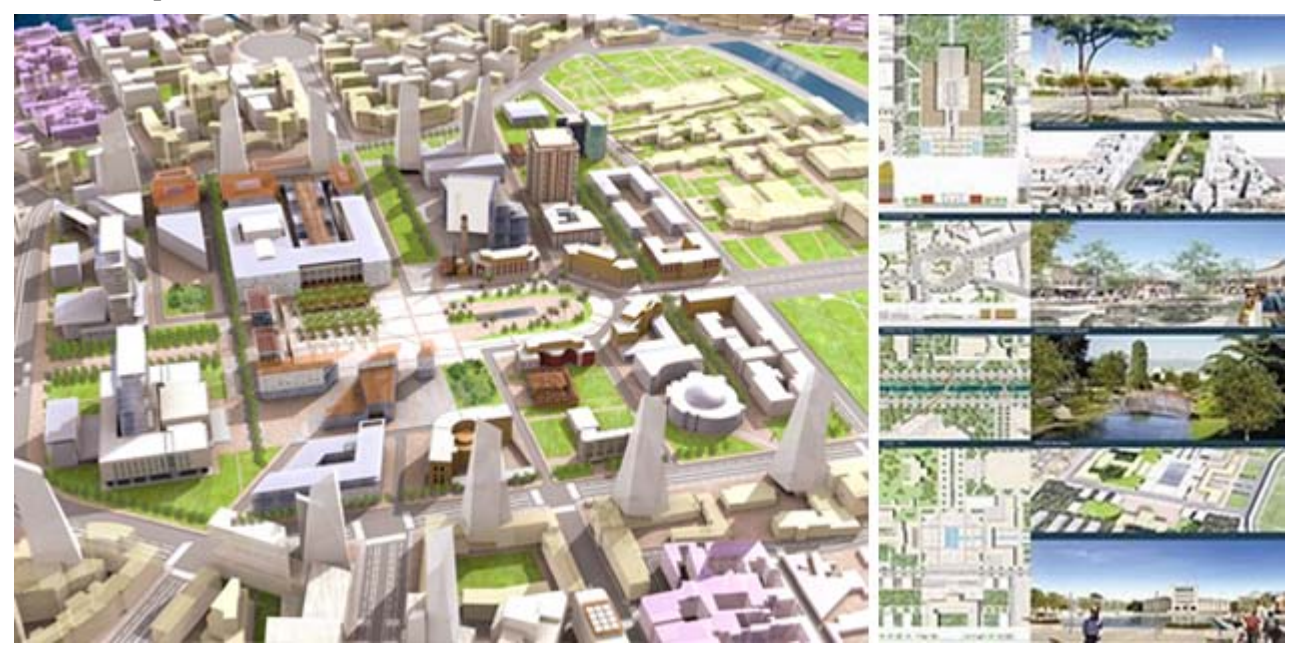
Fig. 7: Model in 3d and renders the the Architecture Studio proposed for Tirana's city center

The habitants of Tirana has shown that mostly of the time suffer and swallow the feelings for a place even that they don't agree with the decisions of the government or the municipality for a certain place. Drastic changes happened after the year 2000 in the city, while again the urban plan for the city center was again left in the hands of foreign architects. Tirana Center was again a Tabula Rasa. Renders and beautiful images shocked the habitants which understood the drastic changes after some of the projects ideas were implemented. It took a while to comprehend that it couldn't turn back the old, behaviors, memories, attitudes about these places.