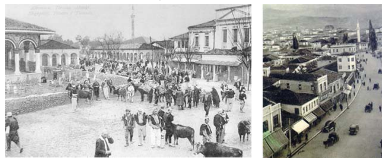
Fig. 4: Old Bazaar, Foto of 1939, on the left and on the right, The old bazaar and the old mosque seen from the clock tower.

The first stone in the city of Tirana was the old bazaar. Tirana, firstly a village was in the middle of Albania in a good position for the trade and the changing of goods. According to Kera Passenger were meeting in Tirana to buy, sell and rest before they proceeded in other city. (Kera, 2004) The symbols the marks and the outlines of the old bazaar are erased from the place that it used to be and nowadays mostly even from the memories of the habitants. Just a few still say: "At the old Bazaar..."