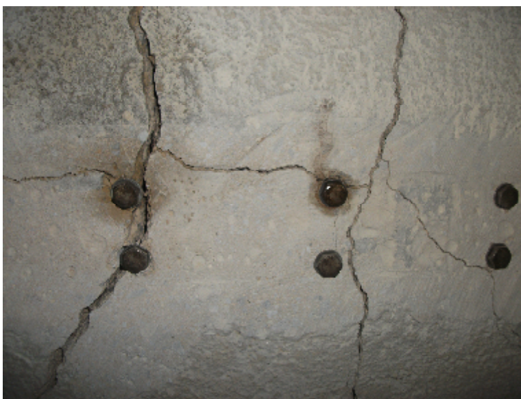
Fig.4. Cracks around the Bolts

General information, crack loads, experimental and theoretical values of bearing capacity are given.