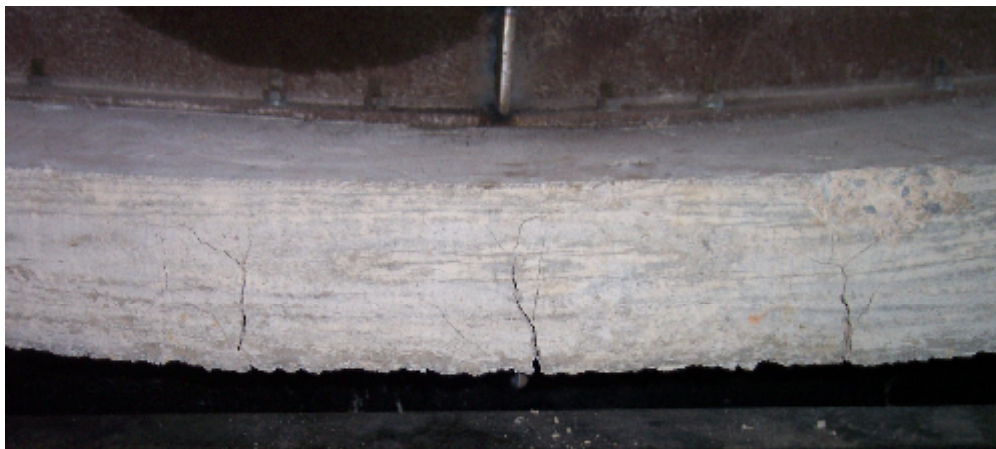
Fig.3. View of Symmetric Cracks at Beams

At all of the tests, left and right side where the load is applied symmetric cracks has been observed at all of the tests.