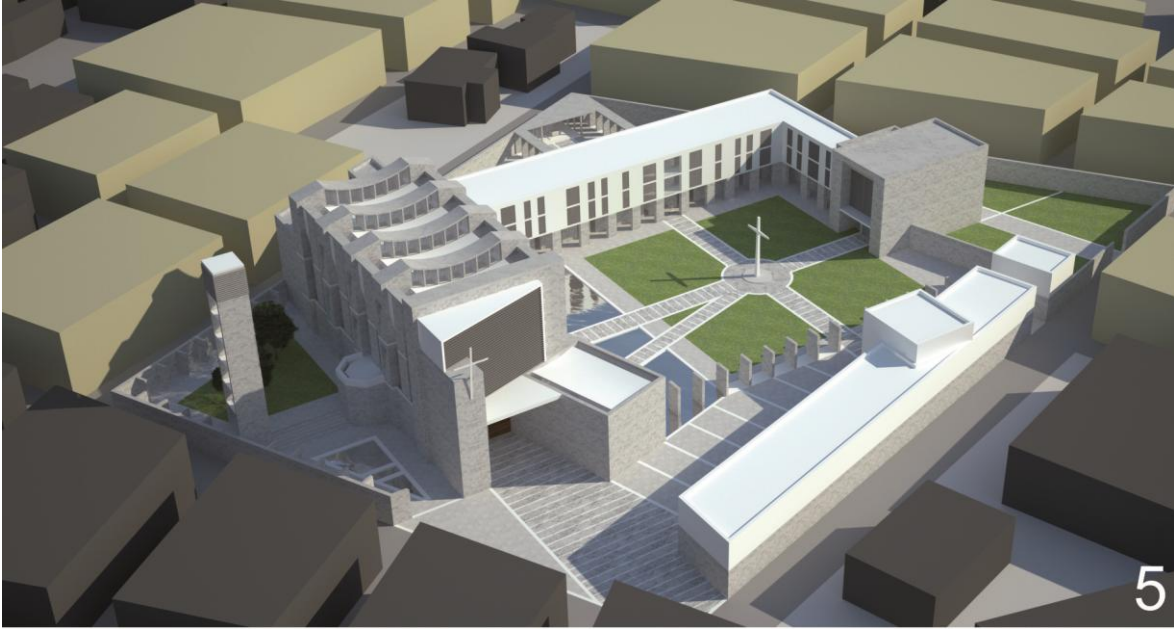
Figure 5: Project in Corato, stud. I. Di Gennaro