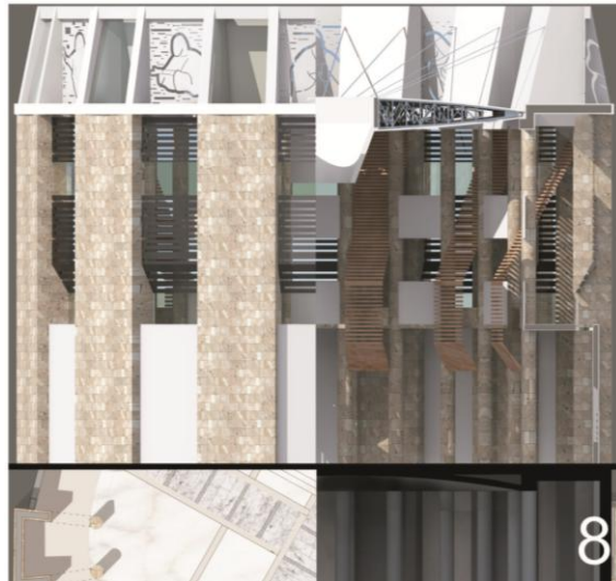
Figure 8: Project in Bisceglie, stud. V. Zecchi