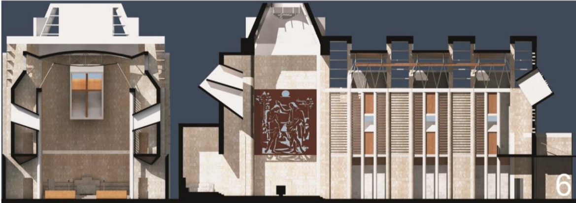
Figure 6: Project in Bisceglie, stud. N. Simone